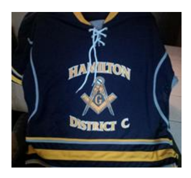
The "C" Next game January 10, 2015, 6PM to 8PM Ridley College Arena 2 Ridley Road, St. Catharines, ON

Following the game all are invited to join us at