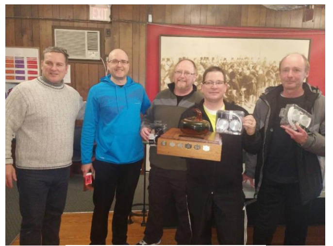
A successful Valley Lodge No.100's 8th Annual Bonspiel!

If you wish more information on DeMolay here is the link to their website, http://www.demolay.org/.