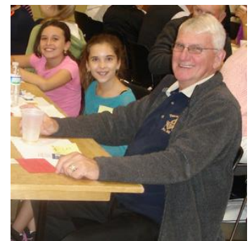
Three Hamilton District D.D.G.M. ’s enjoying some fine food, family, and fellowship