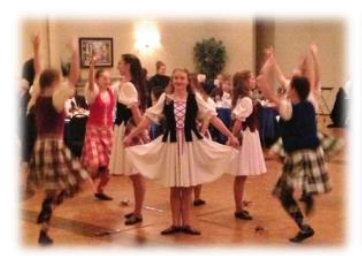
"Happy to Meet, Sorry to Part, and Happy to Meet Again!"

And finally, the Junior Warden's Toast or also known as the "Aberdeen City Toast".