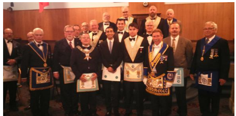
Valley Lodge Members celebrating the Regalia reunion