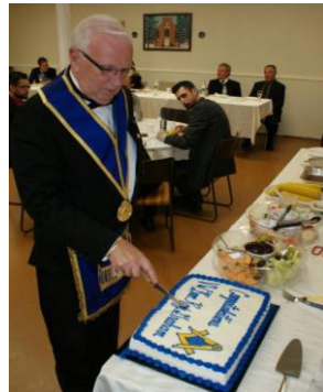
Celebration in the Dufferin banquet room