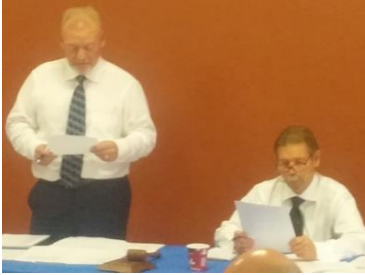
Our District Leadership team!