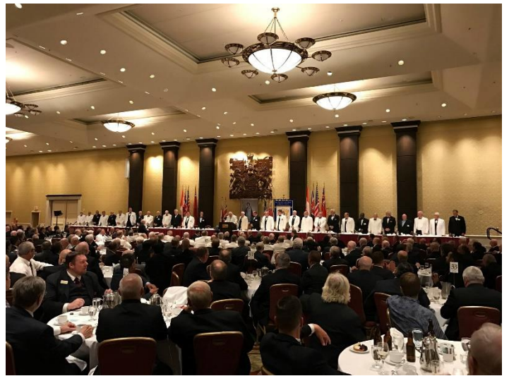
Head Table at the Grand Masters Banquet