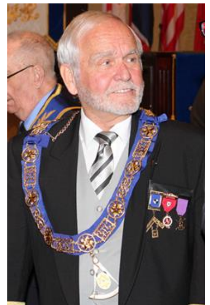
An informal pic of our new G.M. from the Scottish Rite site