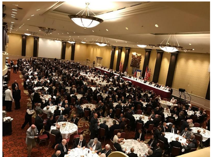
Participants at the Grand Masters Banquet