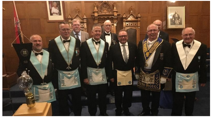
Hugh Murray Lodge No. 602 Fraternal Visit