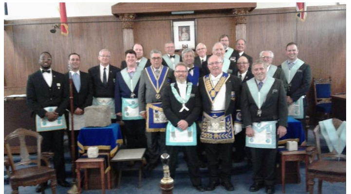
Meridian Lodge No. 687 Fraternal Visit