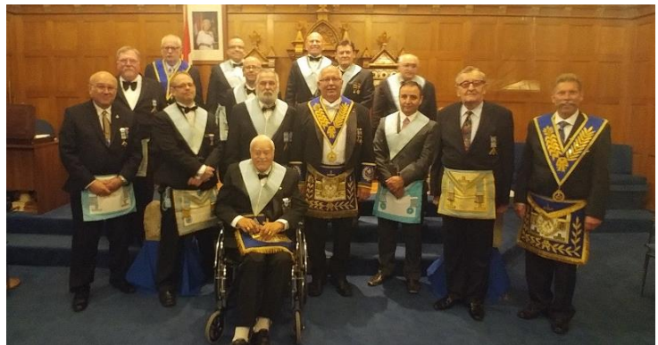
Ionic Lodge No. 100 Fraternal Visit