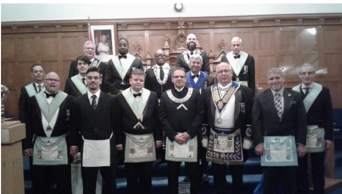
Temple Lodge No. 324 Fraternal Visit