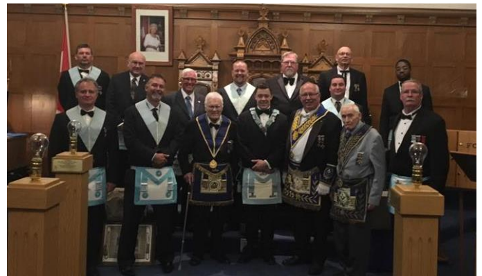
Wardrobe Lodge No. 555 Fraternal Visit