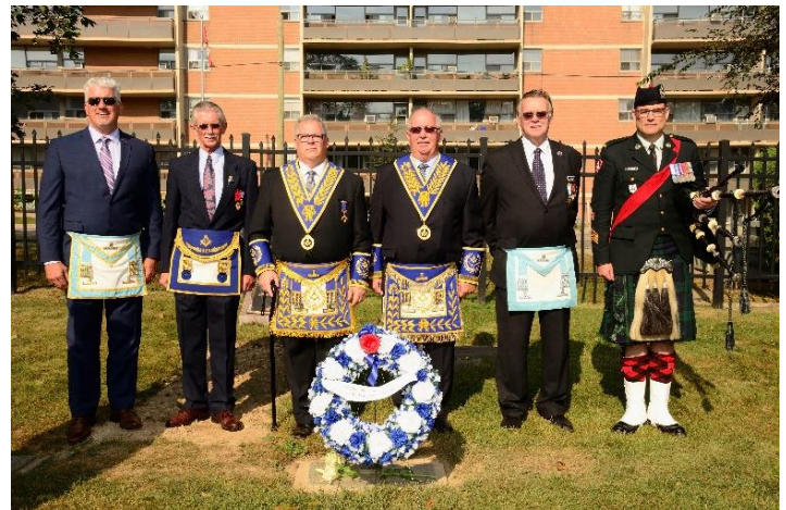
Rededication Ceremony for Hamilton's Fallen Officers