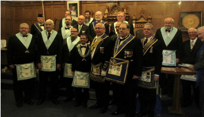
Landmarks / Doric Lodge No. 654 Fraternal Visit