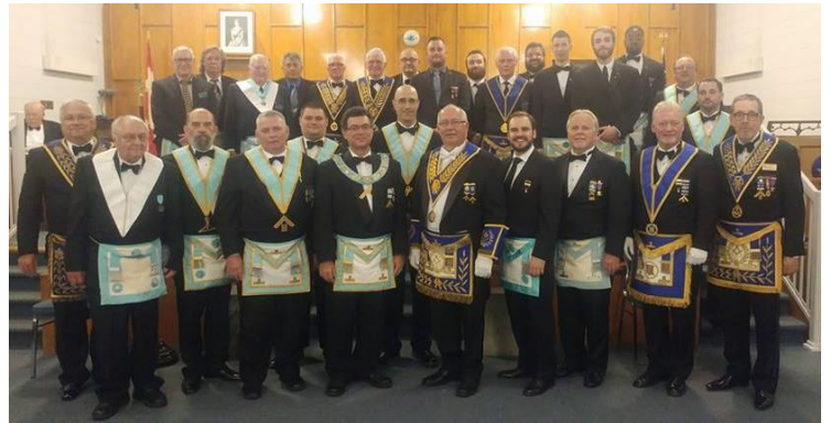
The Electric Lodge No. 495 Fraternal Visit