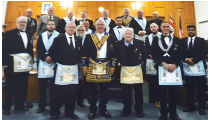
Buchanan Lodge No. 550 Fraternal Visit