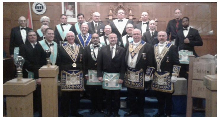
Corinthian Lodge No. 513 Fraternal Visit