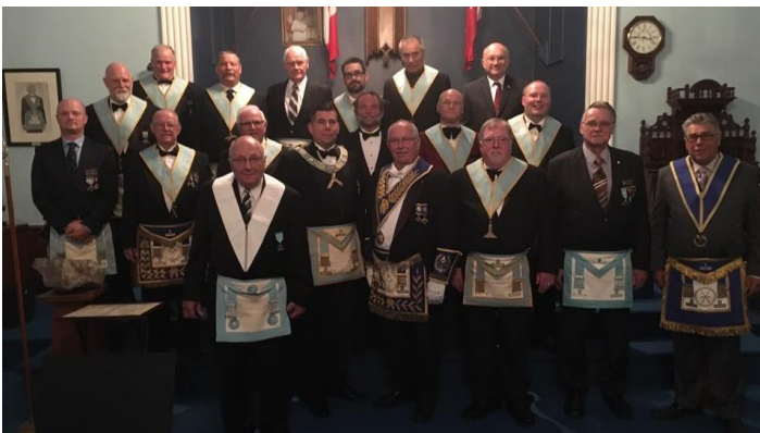
Dufferin Lodge No. 291 Fraternal Visit