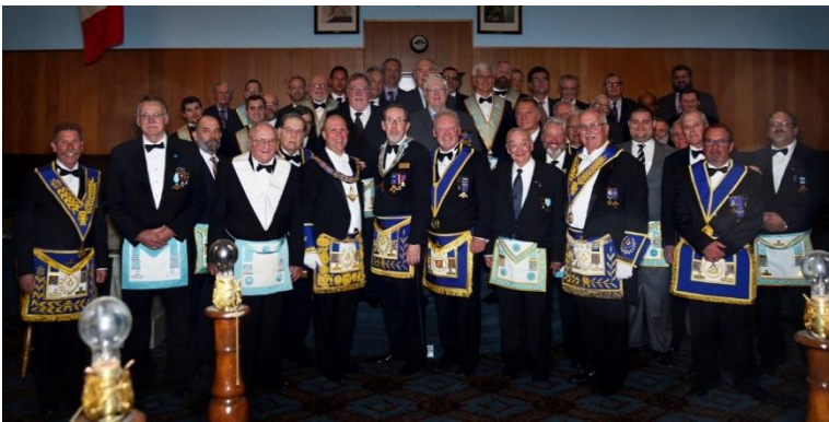
Valley Lodge No. 100 Fraternal Visit