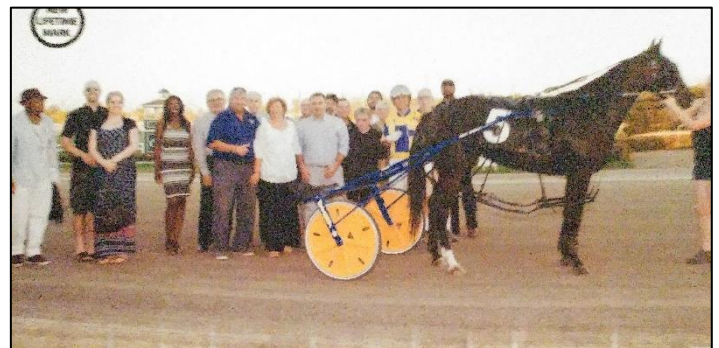
Temple Lodge – Friend to Friend Event at Flamboro Downs