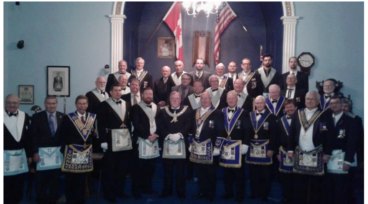
Dufferin Lodge No. 291 Installation of Officers