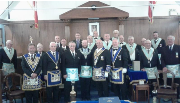
Seymour Lodge No. 272 Fraternal Visit