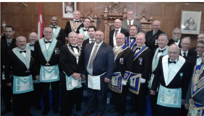
Hugh Murray Lodge No. 602 Official Visit