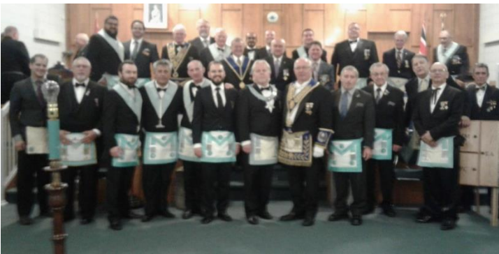
Westmount Lodge No. 671 Fraternal Visit