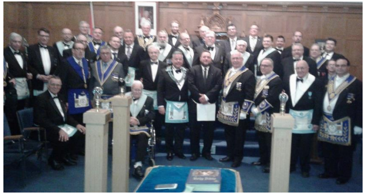
Ionic Lodge No. 549 Official Visit