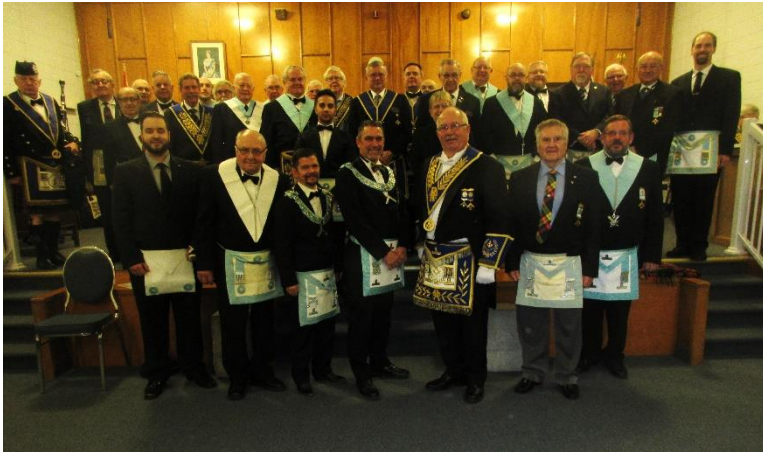
D.D.G.M. Official Visit to Buchanan Lodge No.550