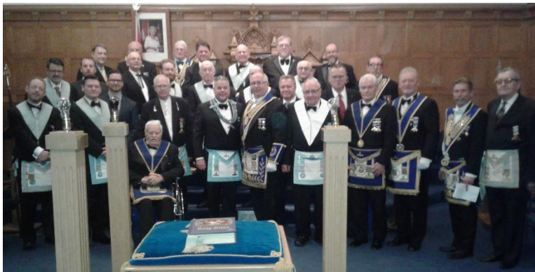
Installation of Officers Ionic Lodge No. 549