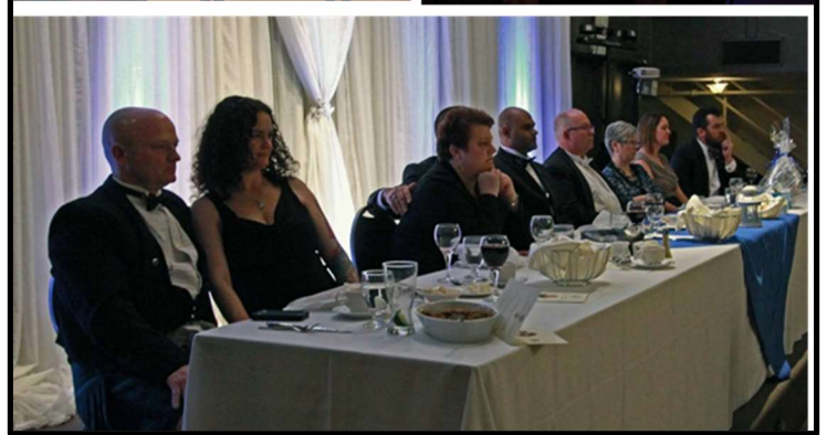
The Distinguished head table at the Hugh Murray Lodge No. 602 Robbie Burns Dinner