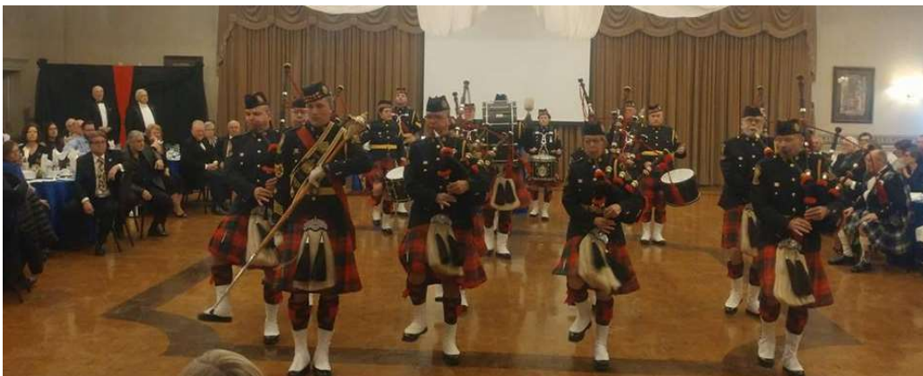
The Electric Lodge No. 495 - Robbie Burns Night with the Halton Police Service Pipes & Drums