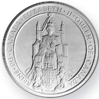
The present seal, for Queen Elizabeth II, used since 1955

The Great Seal of Canada is one of the oldest and most venerated instruments of our government. Since the earliest days of our nation, Canada's most important documents have been made official through its imprint. The Great Seal signifies the power and authority of the Crown flowing from the sovereign to our parliamentary government.