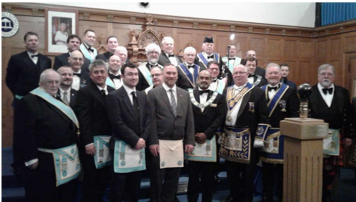
Official Visit at Corinthian Lodge No. 513.