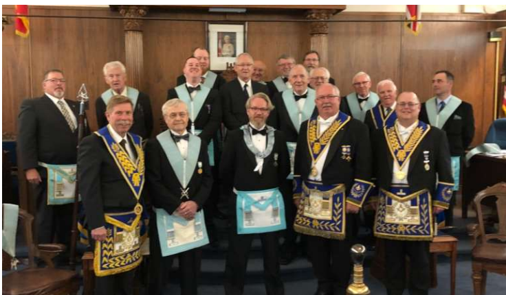
Meridian Lodge No. 687 Wednesday June 13, 2018, Ancaster