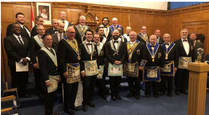
Temple Lodge No. 324 Tuesday June 12 th , 2018, MCH