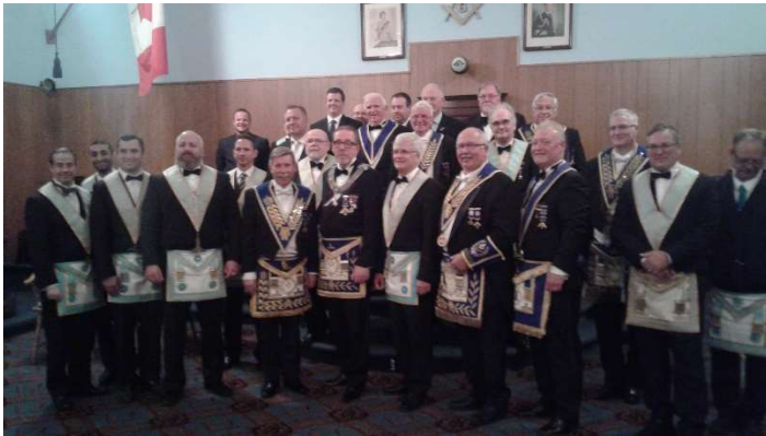
Valley Lodge No. 100 Monday June 11 th , 2018, Dundas