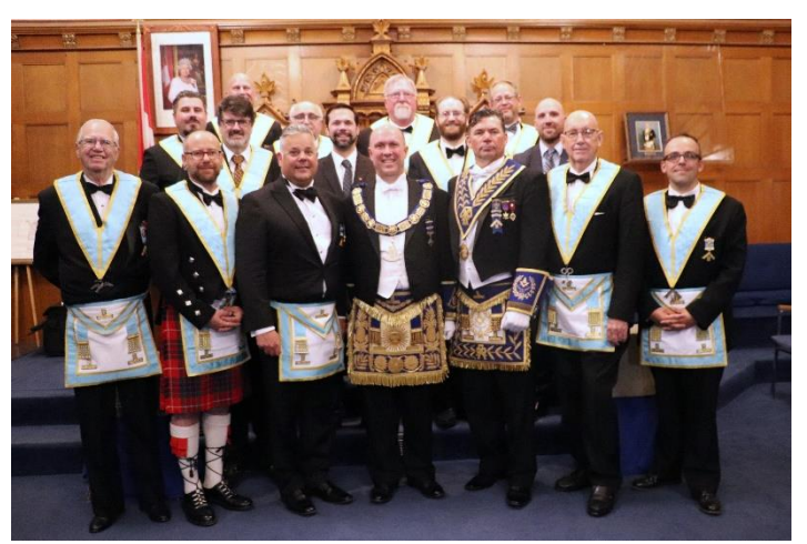
The Grand Master, with Ionic Lodge Officers and Members.