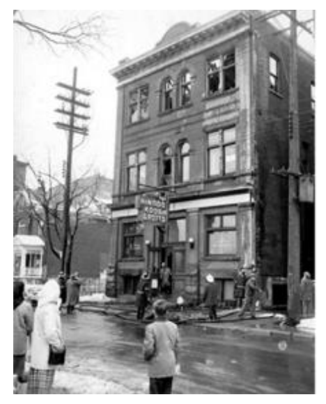
121 Hughson Street

Unfortunately the building took fire on February 1st, 1960, which seems to have lead to the ending of the Hindoo Koosh in Hamilton, Since then, the building has been refurbished and several companies have made use of the facilities.