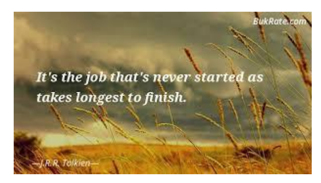
From the Grand Lodge Website ...