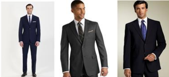
WEAR DARK SOCKS AND RECENTLY-SHINED DARK SHOES