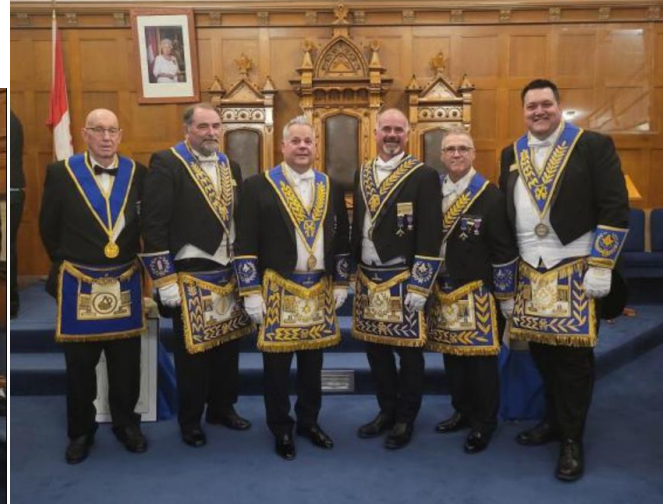
Temple Lodge No. 324