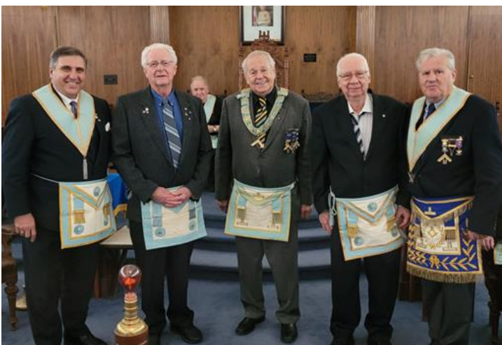
Seymour Lodge No. 272