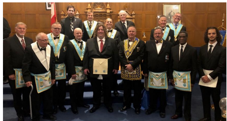
Buchanan Lodge's newest Entered Apprentice