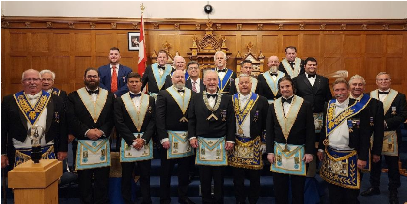
Valley Lodge No. 100