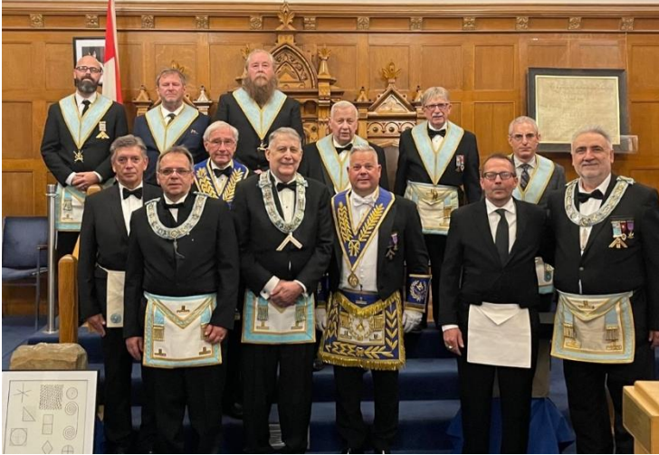
Temple Lodge No. 324