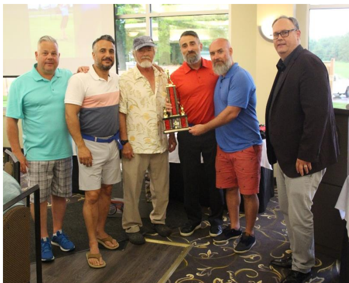
Most Honest Golfer!