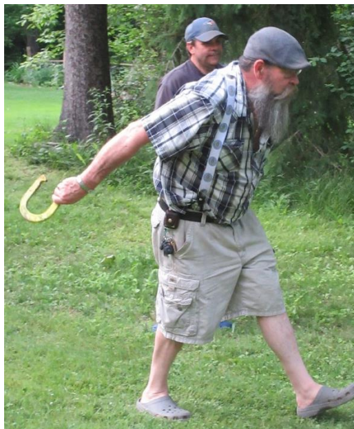
W. Master "instructing the brethren"