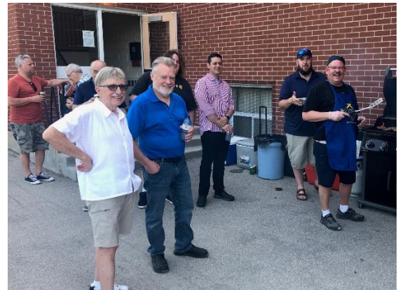
Buchanan Lodge Annual BBQ