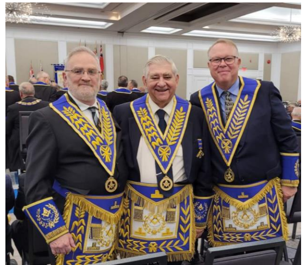
Congratulations to Hamilton's newest District Deputy Grand Masters.