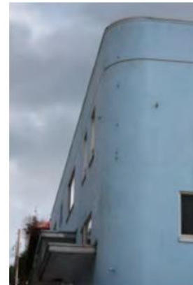
Streamlined corner at Grant & Front