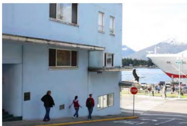
Grant Street facade