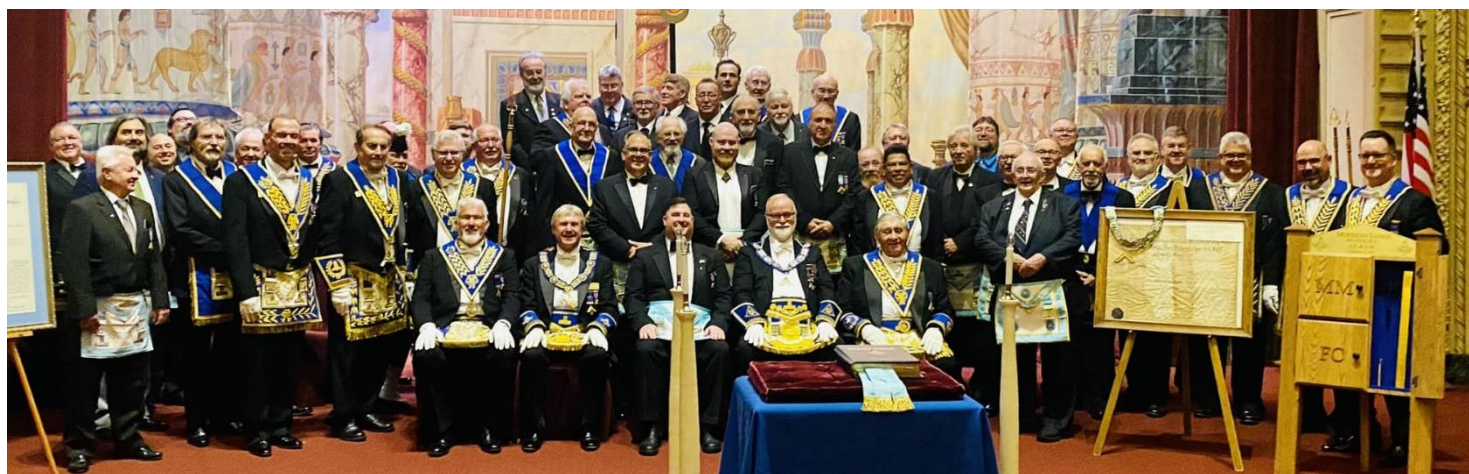
and Meridian No. 513 Installation