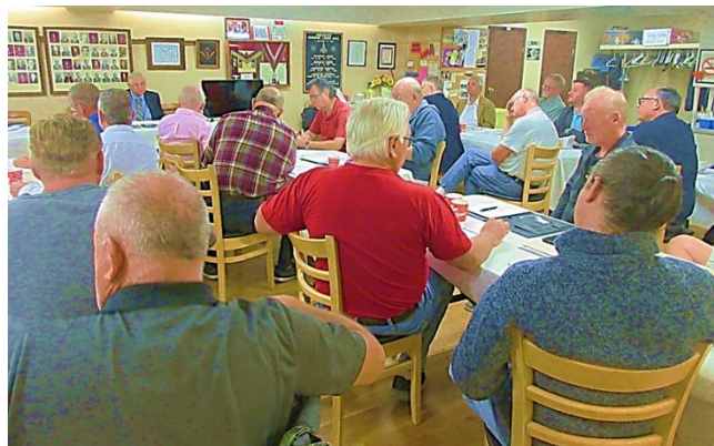
Meridian No. 513 Ceremony of Amalgamation