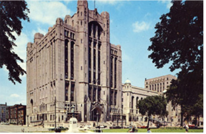
A limited number of seats are available for this tour

Reserve your bus seat by forwarding a cheque ($50 Cdn) payable to Hamilton Masonic District 'C' and a photocopy from your current passport to: