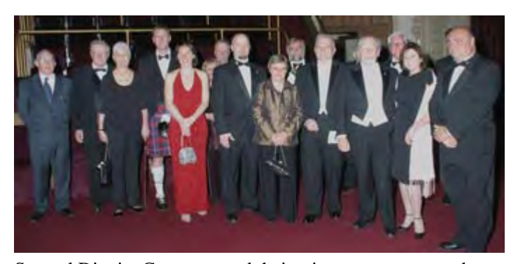
Several District C masons and their wives were presented to the Grand Master.