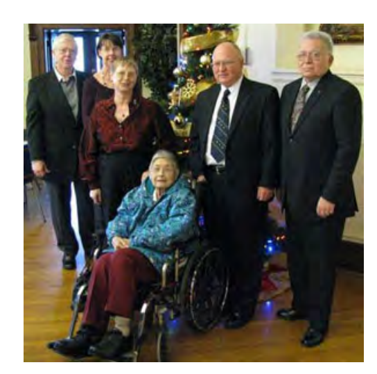
Enjoying the Christmas Levée