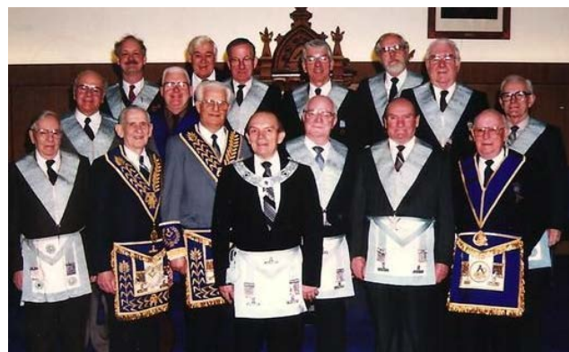
The first group of Officers of Centennial Daylight Lodge No. 679.