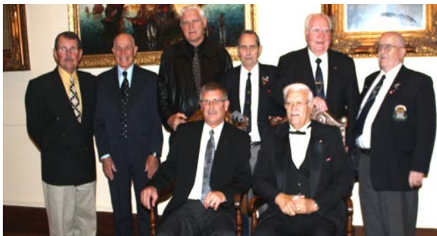
Ionic Lodge