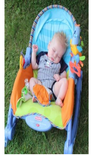
Some young participants found the day just too darn tiring.