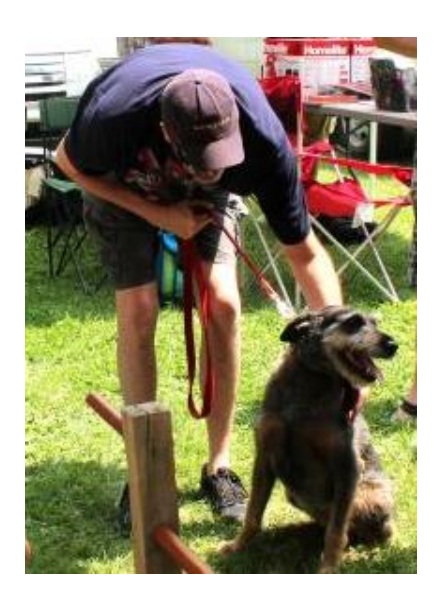
Furry- and featheredfriends joined in on the fun!