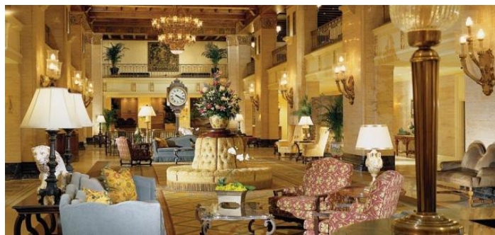
The Main Lobby of The Fairmont Royal York Hotel