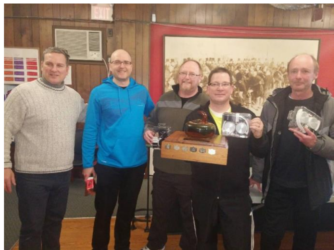
A successful Valley Lodge No.100's 8th Annual Bonspiel!

If you wish more information on DeMolay here is the link to their website, http://www.demolay.org/ .