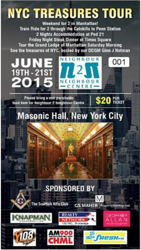
Tickets available from Lodge Secretaries Or any Hamilton District C Chairmen