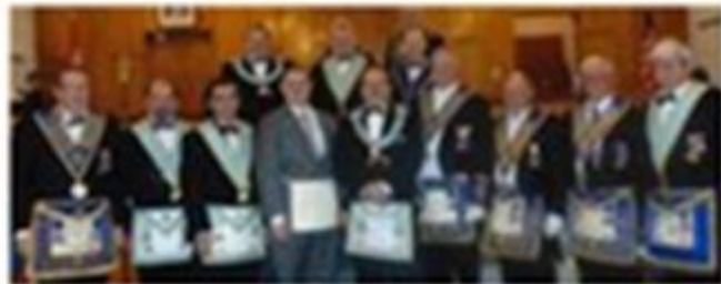
THE ELECTRIC 495