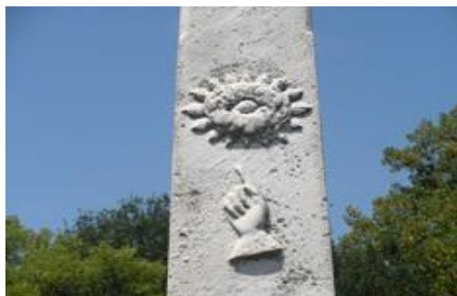
Laurel Hill Cemetery, Philadelphia, PA (pointing to all-seeing eye: God)

Passed To the Grand Lodge Above, November 14, 2015