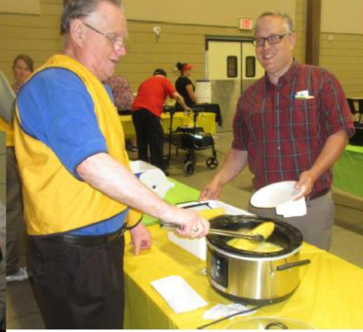
IN SUPPORT OF ST. PETER'S HOSPITAL FOUNDATION LEARNING CENTRE FOR HAMILTON