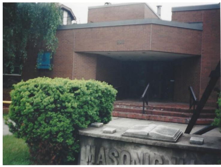
C.M.T. at 908 and 918 Main Street East

principles, to meet the future with renewed confidence.