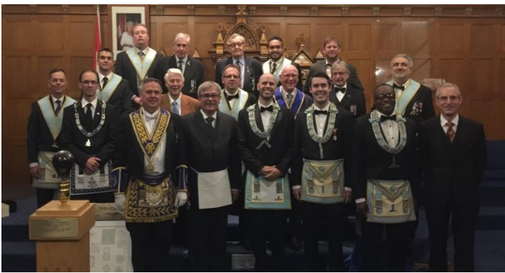
Temple No. 324