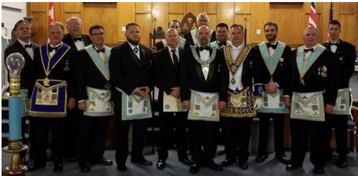
The Electric No. 495