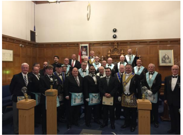
High Murray Lodge No. 602