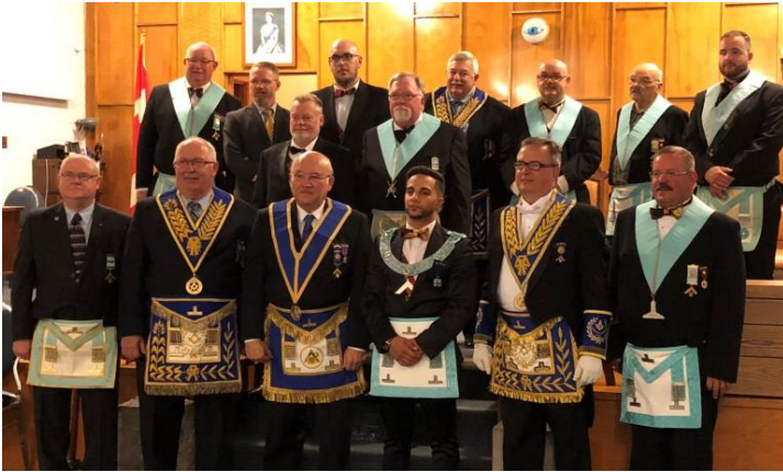
Buchanan No. 550