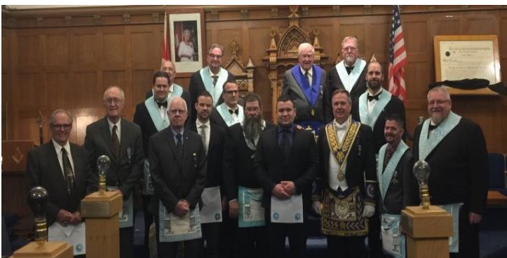
Ancient Landmarks/Doric No. 654