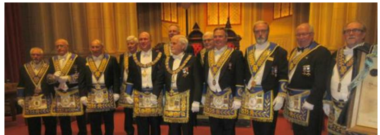
Grand Lodge Officers Assisting with the Amalgamation