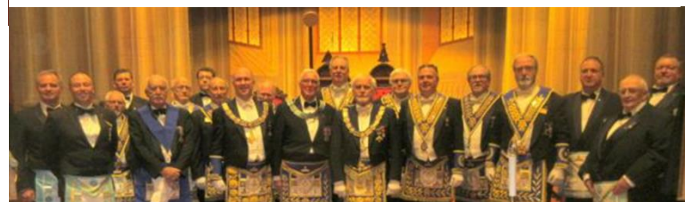
Harodim No. 513 Officers