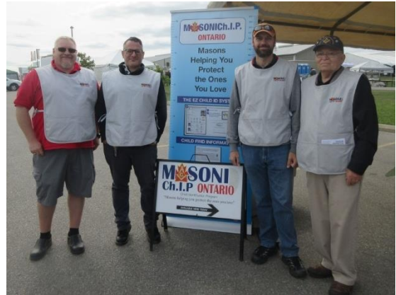
MasoniCh.I.P. hosted by Landmarks/Doric and Buchanan Lodges

Kits Distributed throughout Ontario to date 72,208