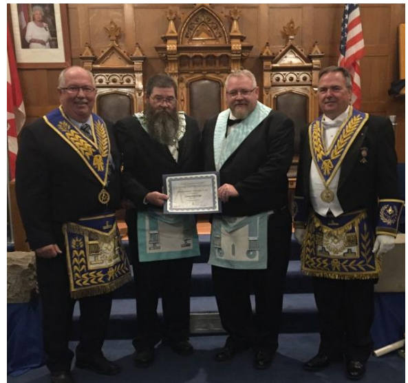
Ancient Landmarks/Doric No. 654