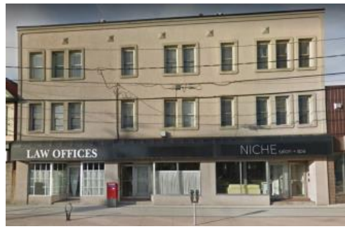
Current Google map picture of Concession St.

By December 30, 1921, there was enough masonic interest to institute a second masonic lodge on the centre mountain near the brow. Thus Hillcrest Lodge became a most active lodge initiating some 20 candidates in its first five months, in the newly renovated 3 rd floor lodge hall, with accompanying dining-room and anti-room. The ceremony of constitution and consecration took place on October 17, 1922. Hillcrest Lodge No.594 remained on Concession Street until selling their hall and purchasing new facilities on Mohawk Road in 1995. The DDGM recommended that it was time to divide the 30 lodges into 2 Districts which came to fruition in 1923.