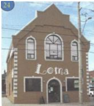
Hillcrest Lodge building 1920 was at 538 Concession Street.

Current picture at the original site of Buchanan Lodge, with the lodge hall on the second floor and banquet hall and facilities on the first floor.