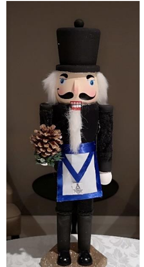
Centrepiece from the Valley Lodge Christmas Dinner