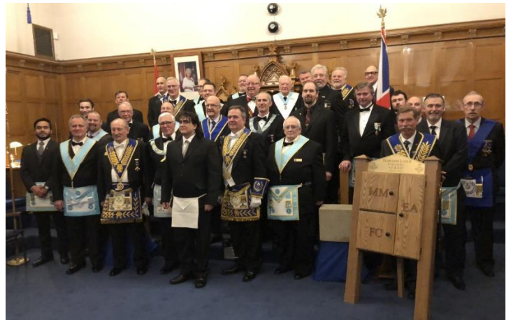
Haroldim Lodge No. 513