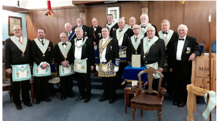
Seymour Lodge No. 272