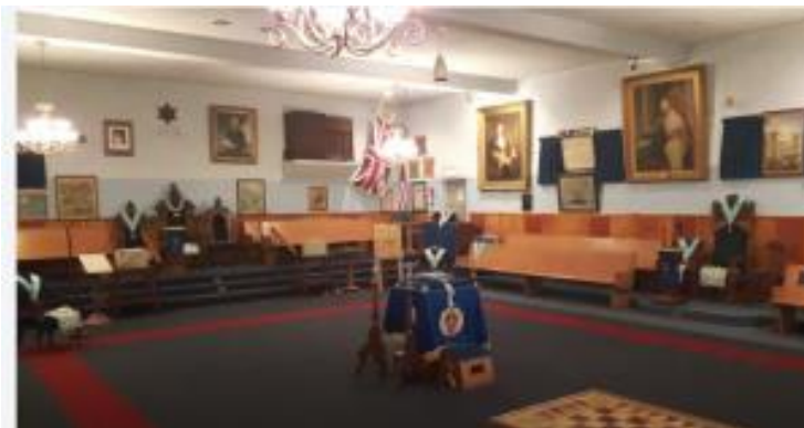
Picture of Beach Lodge Building, THEN AND NOW