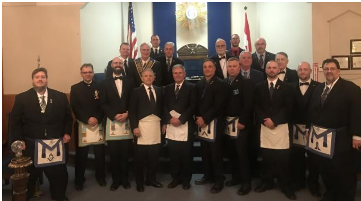
Temple Lodge No.324 carrying on a 100+ year tradition by returning a Travelling Gavel to Niagara Lasalle No.132 in New York State.