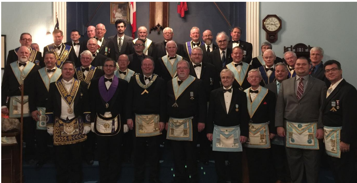
The 145th Installation and Investiture of the Worshipful Master and his Officers October 18, 2018

Likewise, as Dufferin Lodge approaches its 150th anniversary we are supported by renewal through newly initiated and affiliated members.