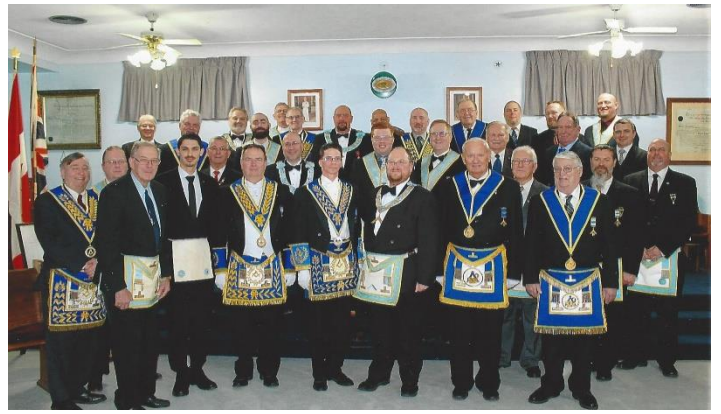
Copetstone Lodge No. 373, Niagara District B