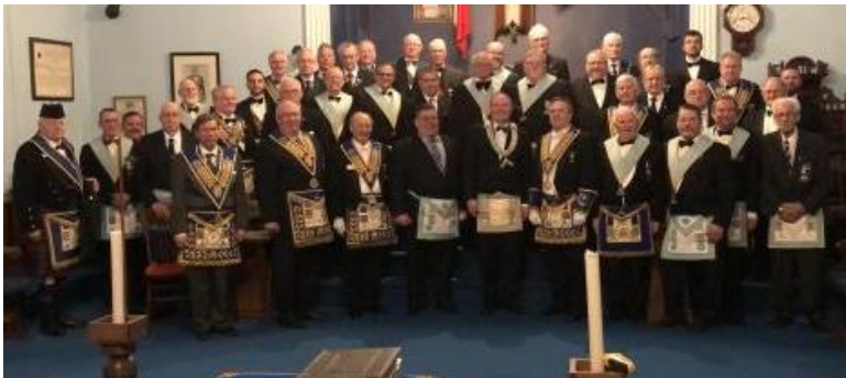
Dufferin Lodge No. 291