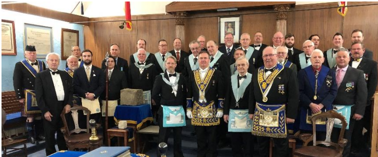
Meridian Lodge No. 687