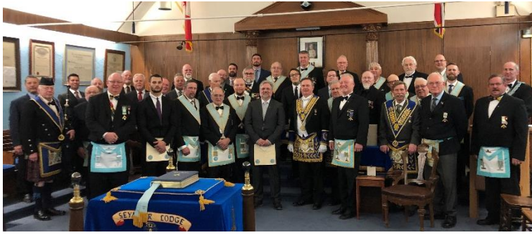
Seymour Lodge No. 272