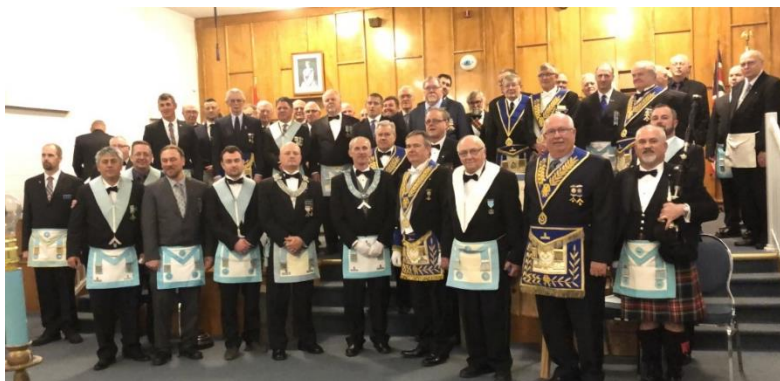
Westmount Lodge No. 671