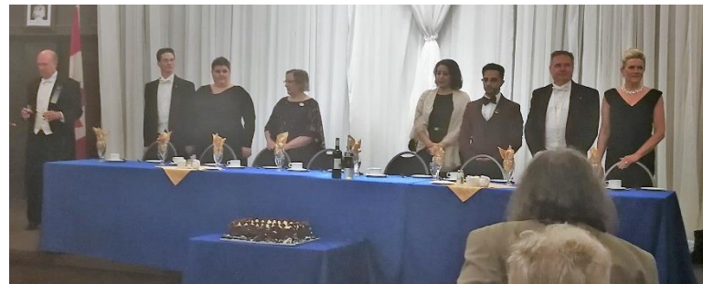
The Head Table at the Buchanan Centennial Dinner and Dance