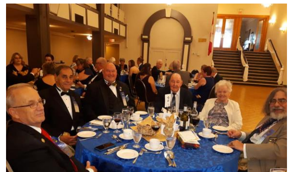
Guests from Western Star Lodge No. 21 of Youngstown, Ohio