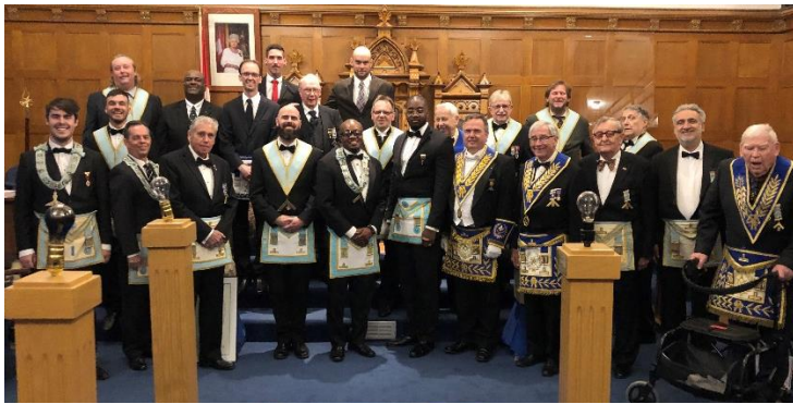
Temple Lodge No. 324