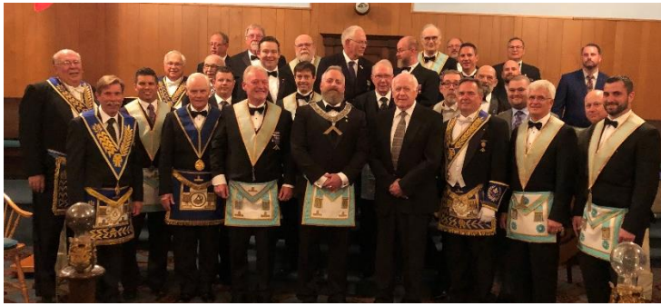
Valley Lodge No. 100