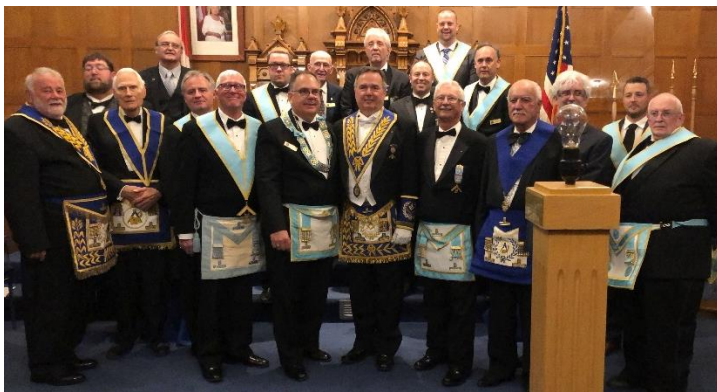
Harodim Lodge No. 513