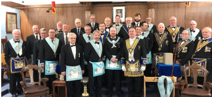
Meridian Lodge No. 687