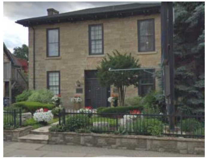
Site at 393 King Street West currently.

Locally, Hamilton became the home of the first Grotto in Eastern Canada in 1890, growing exponentially to 1,200 members by 1915, when the total 21 Craft lodge membership was 5,002. That year the Hindoo Koosh Grotto purchased its first permanent home at 393 King Street West, just a few houses west of the future site chosen by Grand Lodge for its Memorial Office at 363 King Street West in 1960. This was formerly occupied by Cotterell's Funeral Home as a chapel. Until this purchase the Grotto had met in various places around Hamilton. Almost every time they met, it was in a different location.