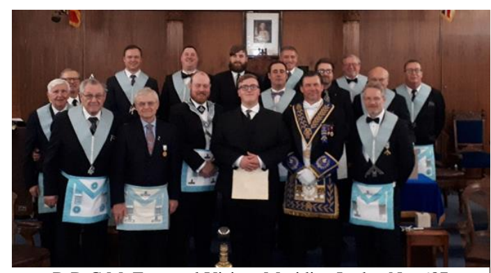
D.D.G.M. Fraternal Visit to Meridian Lodge No. 687

There will be no ticket sales at the door. See the District Secretary for registration form