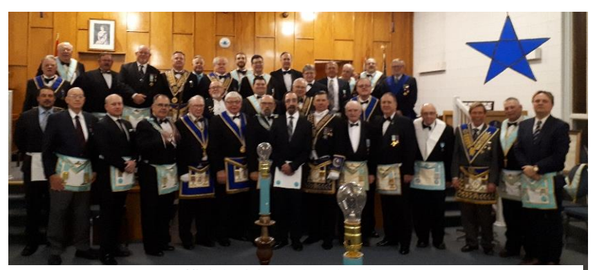
D.D.G.M. Official Visit to The Electric Lodge No. 495