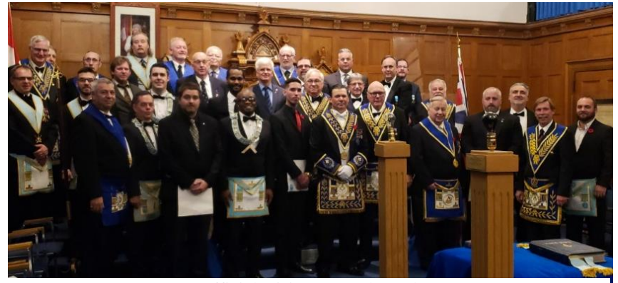
D.D.G.M. Official Visit to Temple Lodge No. 324