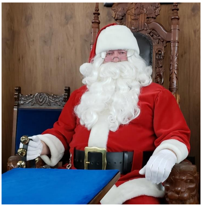
Santa sitting in the East at North Pole lodge No.1 getting ready for the big day.