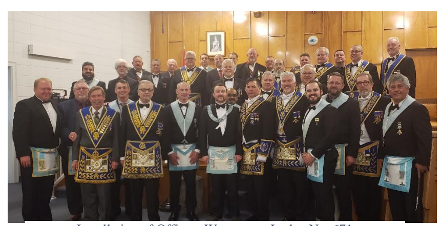
Installation of Officers Westmount Lodge No. 671