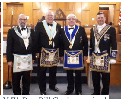
his 50 years in Masonry pin