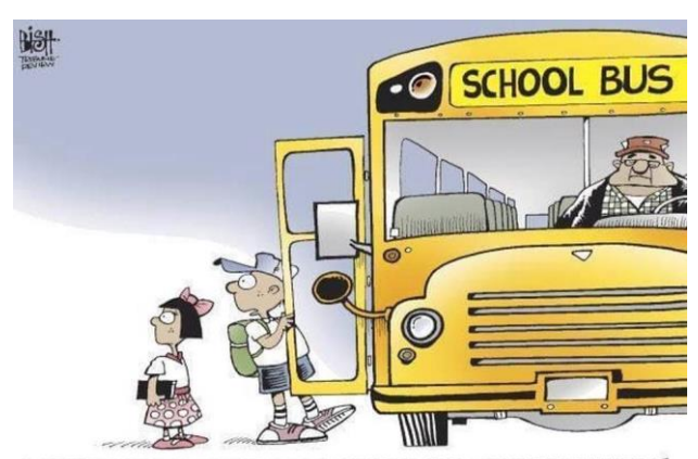
I NEVER KNEW THAT MOM COULD DO CARTWHEELS