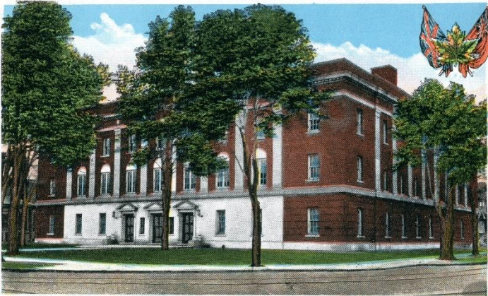
MASONIC TEMPLE, WINDSOR, ONT., CANADA.

The Masonic Temple is a large, three-storey, red brick Neo-Classical Revival style building with contrasting limestone trim. Completed in 1922 and located on Windsor's main street (Ouellette Avenue) in the city core. It has been recognized for its heritage value by the City of Windsor By-law 11786, 1994.