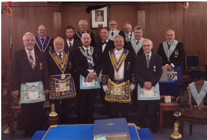
Meridian Lodge No.687 D.D.G.M. Fraternal Visit

Another great night at Westmount. We had a fraternal visit from our DDGM, did a first degree and ran our elections! Thank you to all that came out.