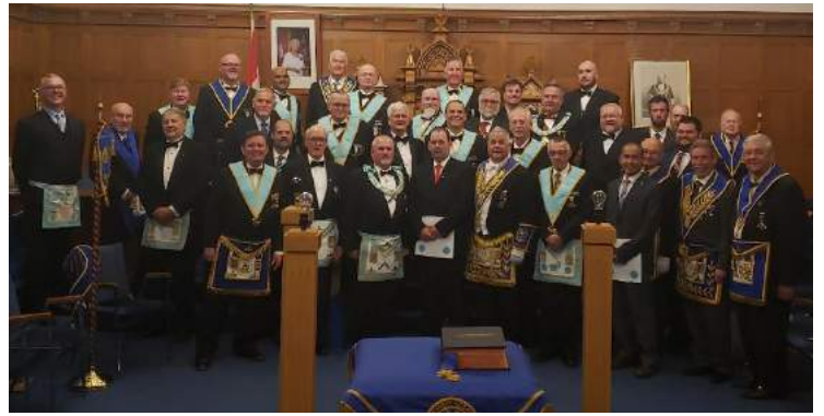
Hugh Murray Lodge No.602 D.D.G.M. Official Visit