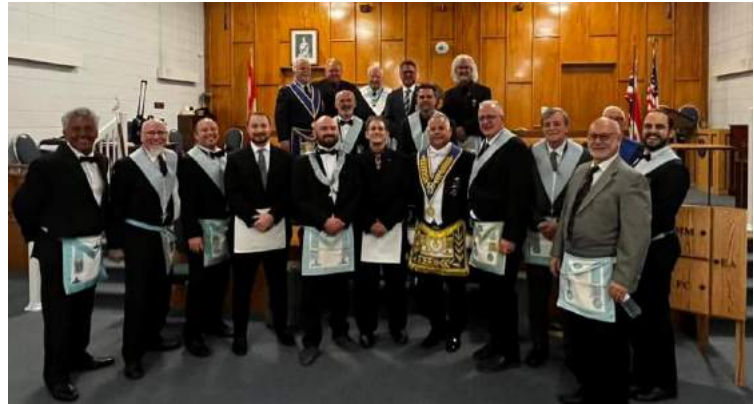
Westmount Lodge No.671 D.D.G.M. Fraternal Visit

Another great night at Westmount. We had a fraternal visit from our DDGM, did a first degree and ran our elections! Thank you to all that came out.