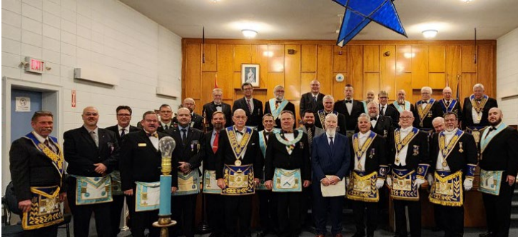
Buchanan Lodge No. 550