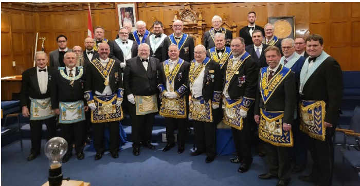
Landmarks / Doric Lodge No.654