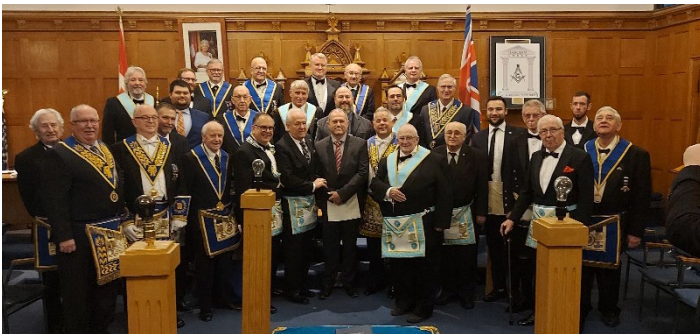
Harodim Lodge No. 513