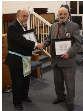
Father and Son receive their service awards