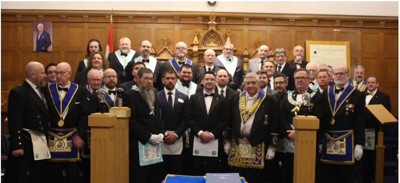
D.D.G.M. Official Visit to Ancient Landmarks / Doric No. 654