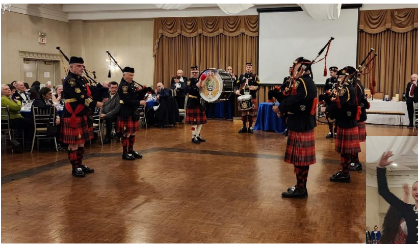
Robbie Burns Celebration with The Electric Lodge