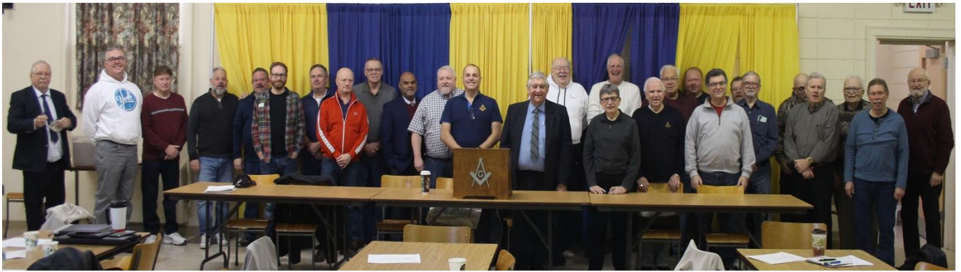
Hamilton District C Winter Meeting