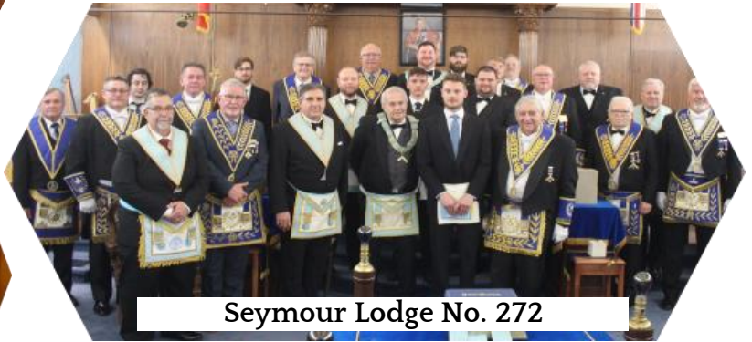
Seymour Lodge No. 272