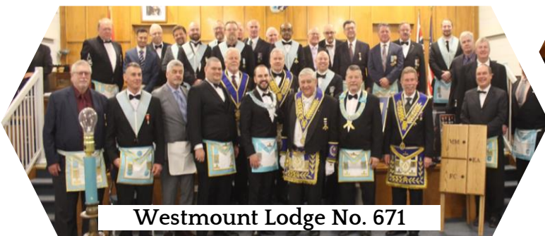
Westmount Lodge No. 671