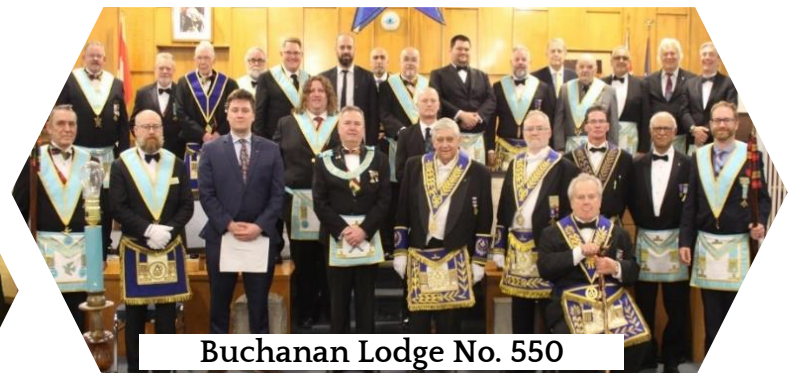
Buchanan Lodge No. 550