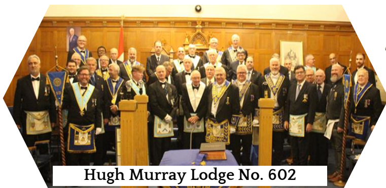
Hugh Murray Lodge No. 602