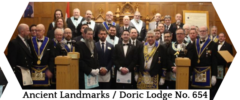
Ancient Landmarks / Doric Lodge No. 654