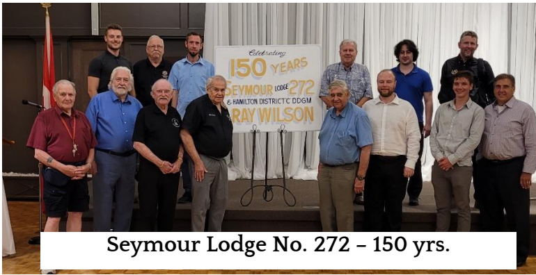
Seymour Lodge No. 272 – 150 yrs.