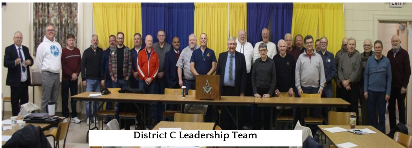
District C Leadership Team