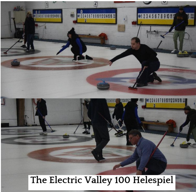
The Electric Valley 100 Helespiel