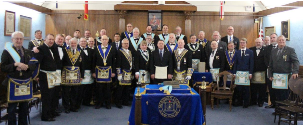
Meridian Lodge No.513 Official Visit