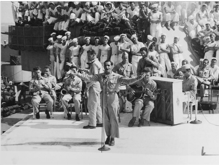
Irving Berlin performing aboard USS Arkansas, 1944

In 1941, after the bombing of Pearl Harbor, again Berlin set himself to write patriotic songs. A collection of those songs became the play "This is the Army." Berlin took the play around the World for a three and a half year tour. During the tour, Berlin took no money or expenses, all money taken in by the play was given to the Army Relief Fund.