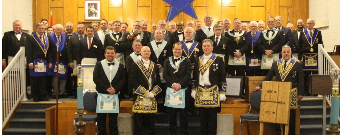
Westmount Lodge No.671 Official Visit