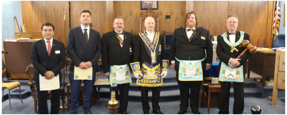
Buchanan Lodge No.550 Receiving the Travelling Gavel at Seymour'