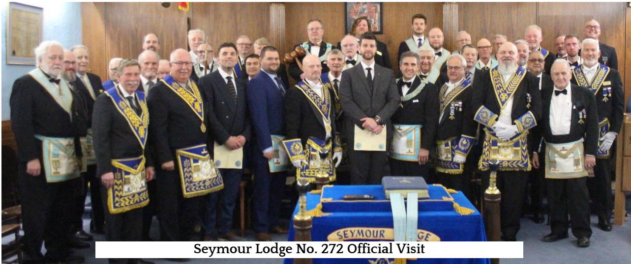
Seymour Lodge No. 272 Official Visit