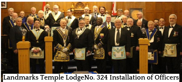
Landmarks Temple Lodge No. 324 Installation of Officers