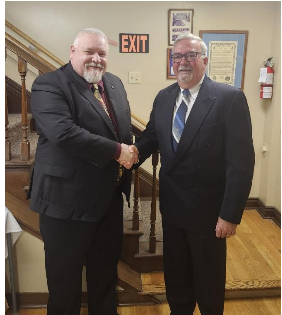
Hamilton South Candidates

9 am Monday June 19 to 4 pm Tuesday June 20