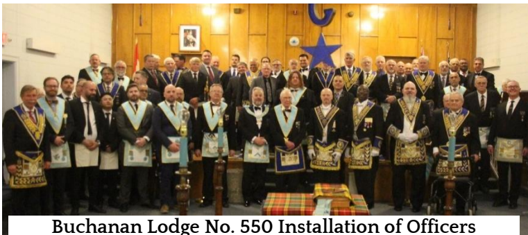
Buchanan Lodge No. 550 Installation of Officers