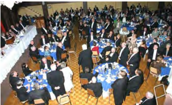
This is what it looked like from the best seats in the hall.