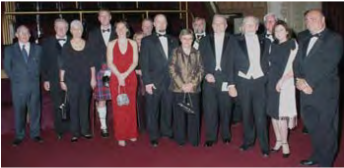
Several District C masons and their wives were presented to the Grand Master.