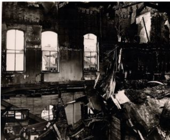
The old Lodge rooms were never the same. Masonic Hall James St. N (1873-1968)

The fire at the James Street Masonic Hall, on September 20th, 1968 caused irreparable damage, and Lodges, Chapters had to find new locations. The building was completely demolished to make way for the York Street extension.